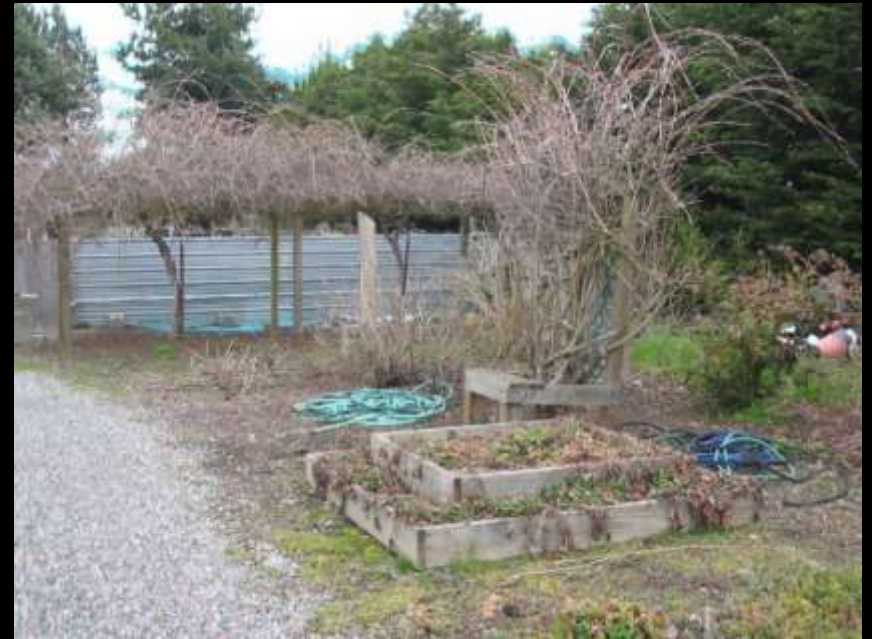
Soft fruit – strawberries, raspberries, hardy kiwis