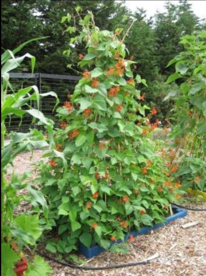
“Scarlet Runner” pole beans