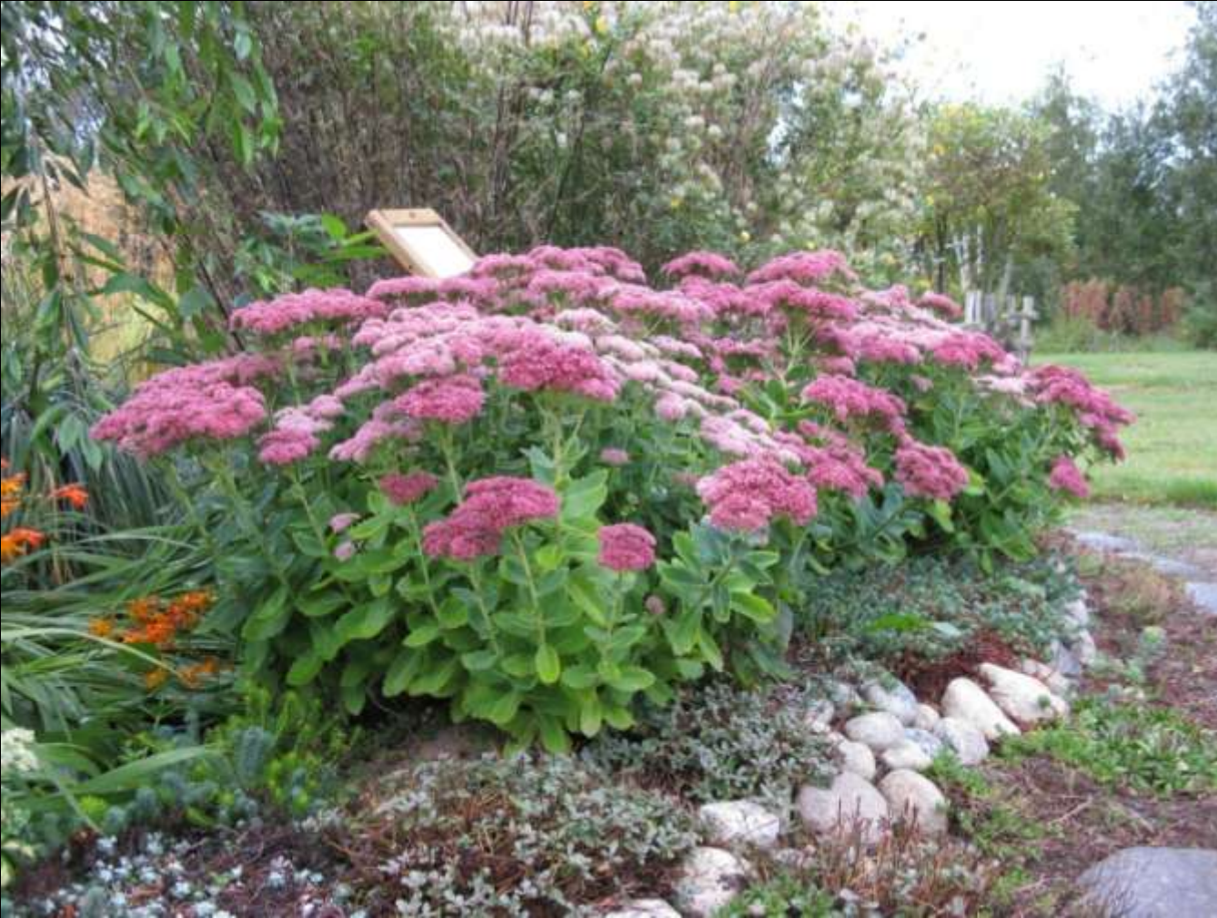
Sedum "Autumn Joy"