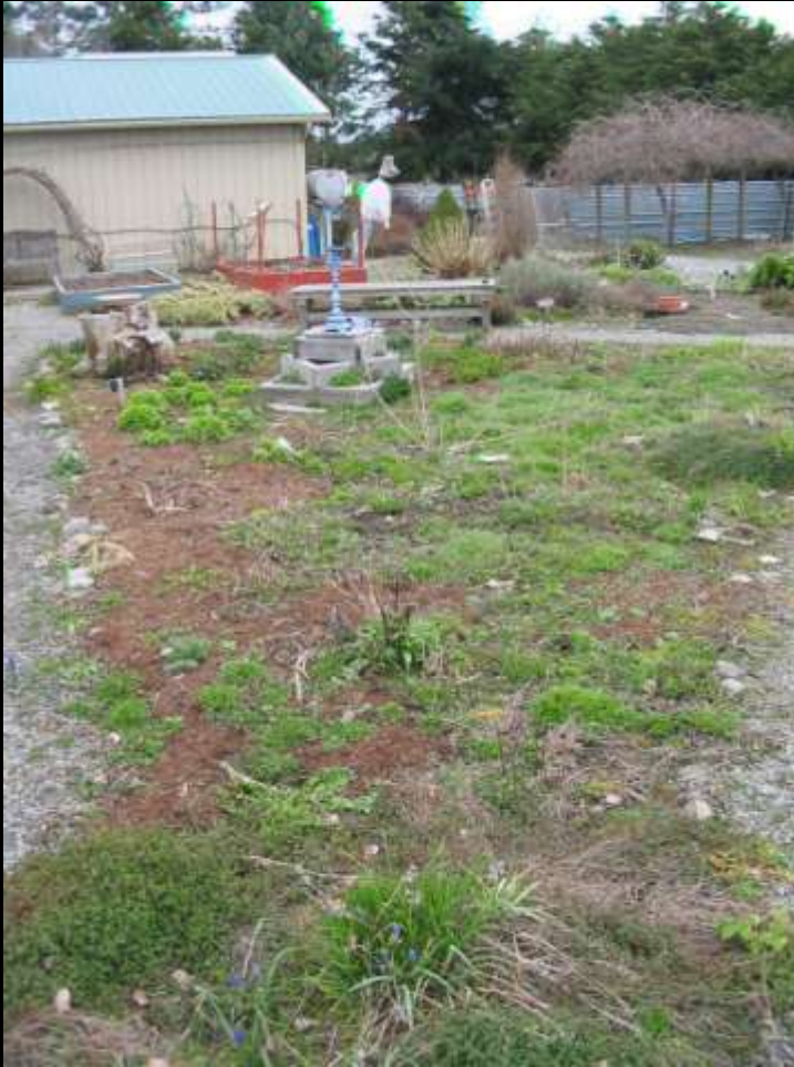
Medicinal Herb Beds