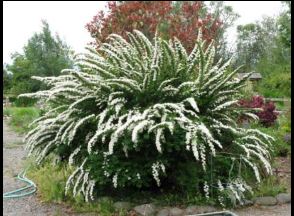
A magnificent Spirea "Bridal Veil"