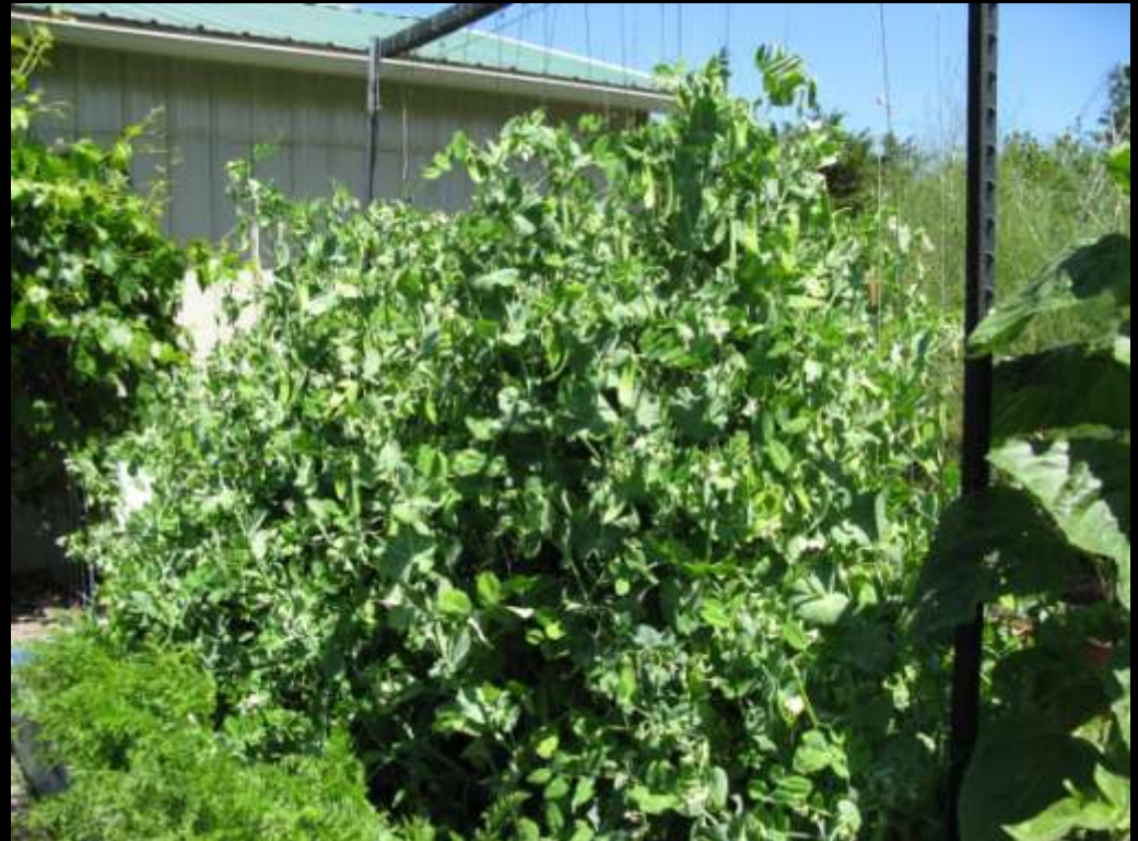
Main crop peas