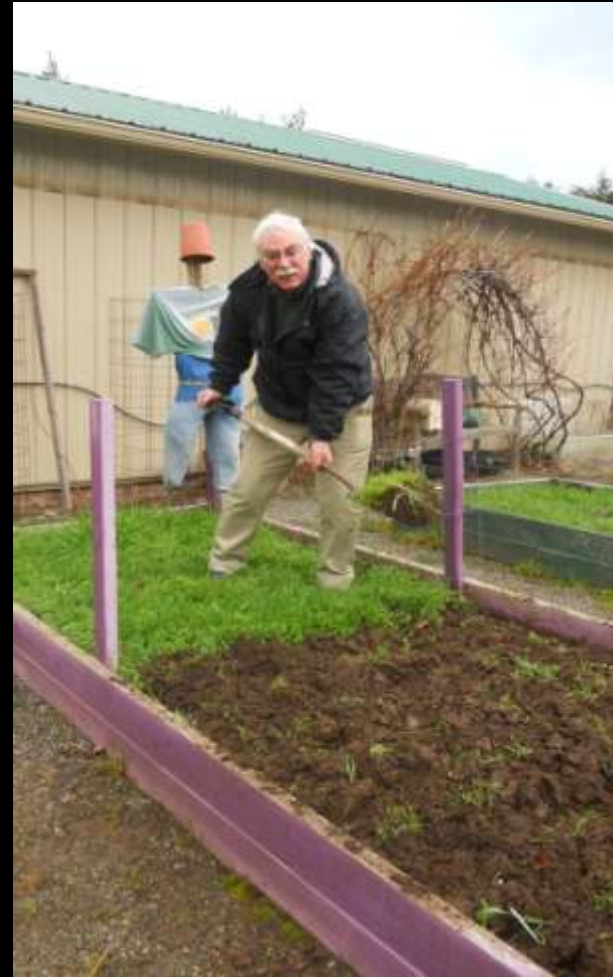
Digging cover crops