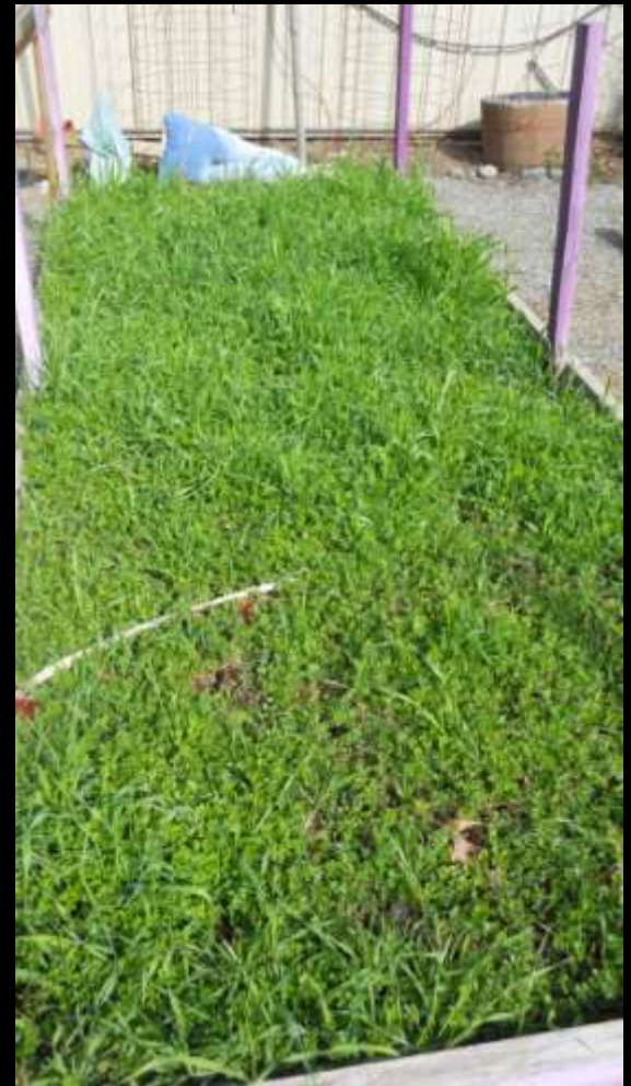
Winter cover cropping