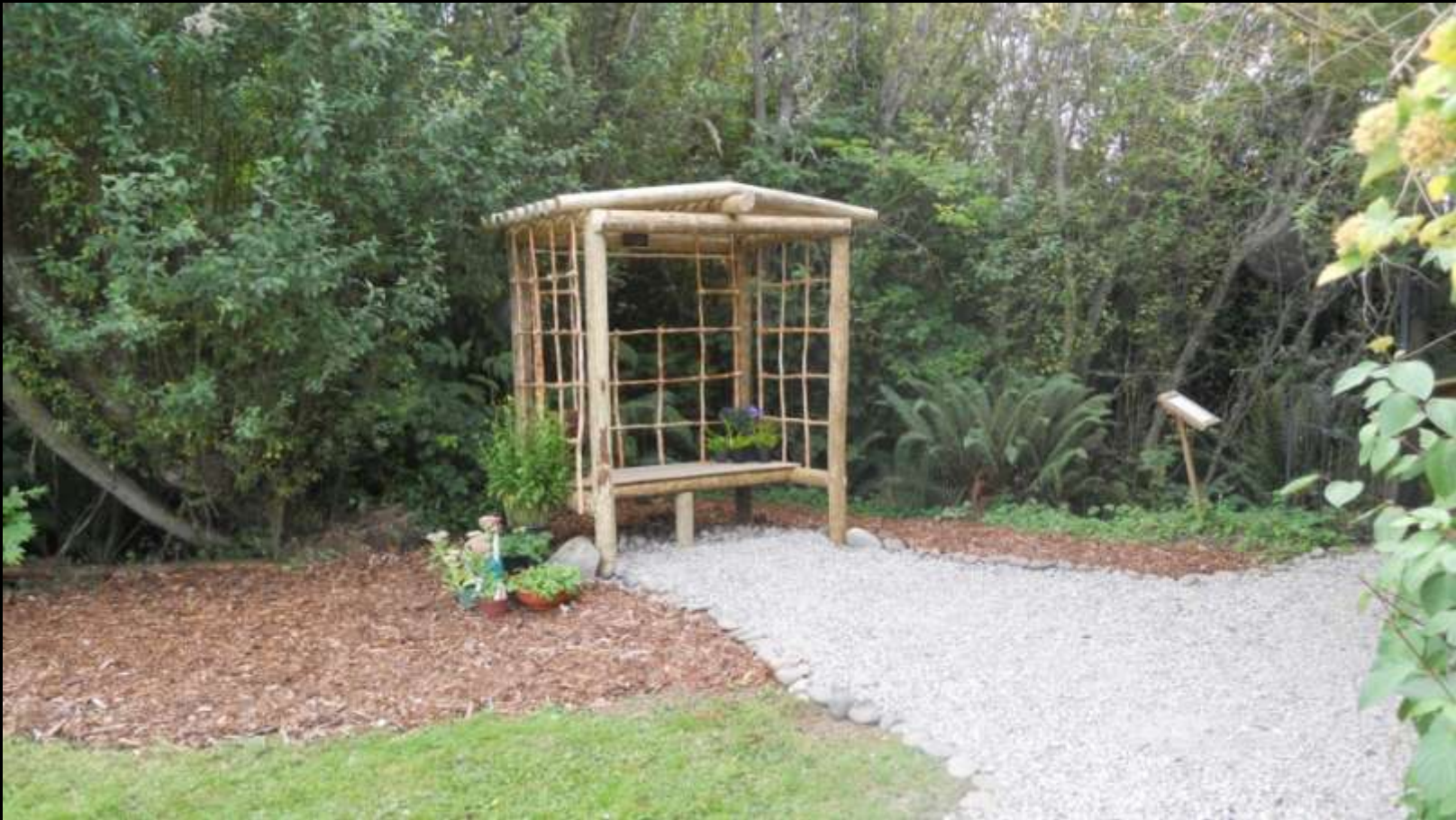
The Thelma Porter memorial Arbor in the shade garden