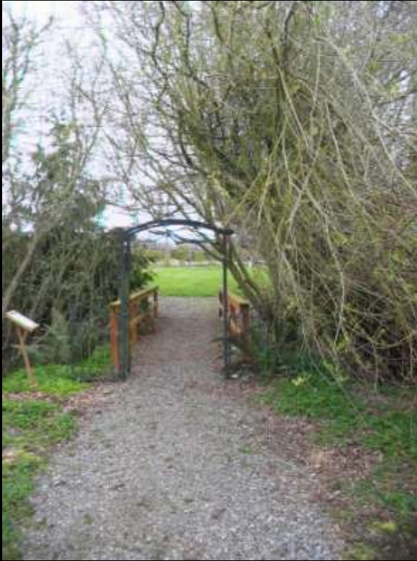
The bridge over the wetland – separates the property