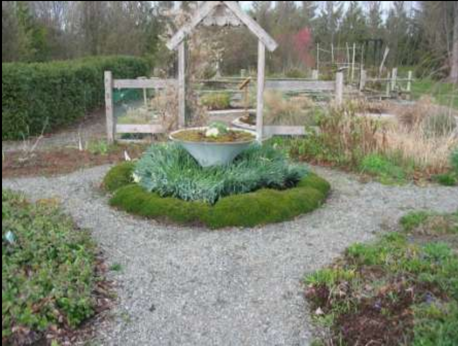
Looking east to the Color and Perennial Shrub gardens