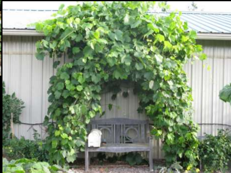
Table Grape vines “Himrod “ and “Candice”