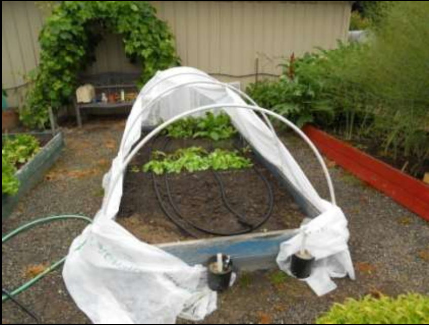
Row cover for leaf miner protection