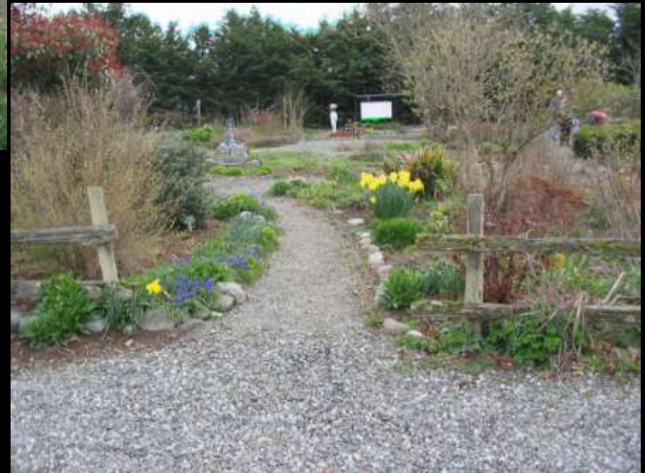
Looking West to the Color Garden, Grasses and Roses