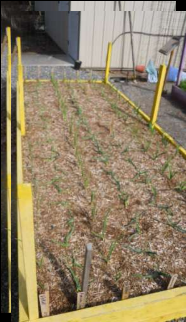
Fall planted garlic