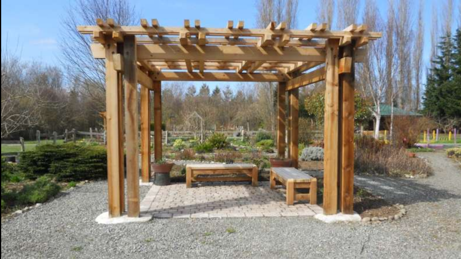
The Thelma Porter Memorial Arbor in the center of the garden