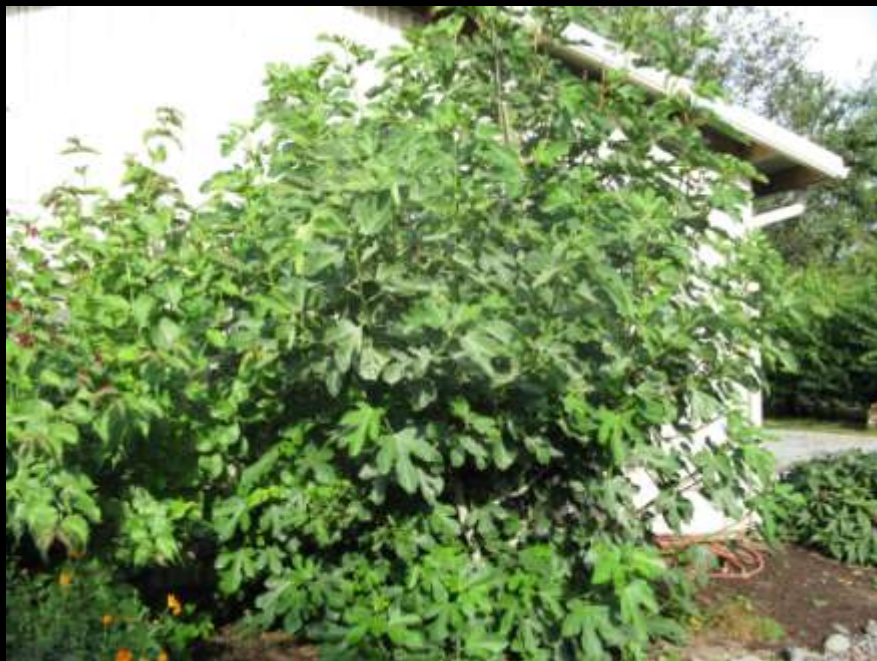
Fig “Desert King”