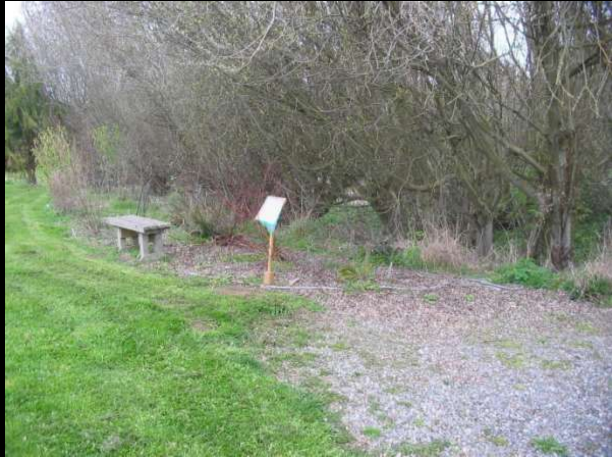
The west side of the wetland – Indian Plums, Flowering currants, Oceanspray